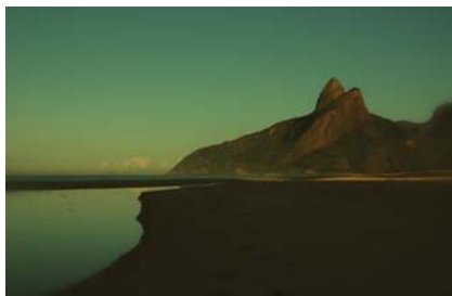
Ipanema 2 Irmãos