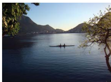
Lagoa Rodrigo de Freitas